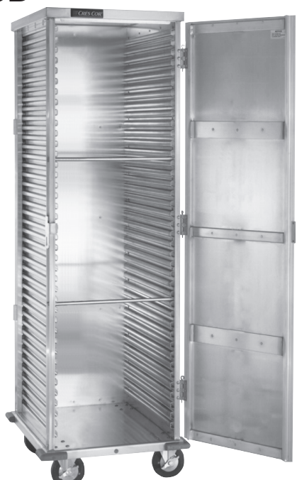
100-1841-DSD (Shown with optional corner bumpers)