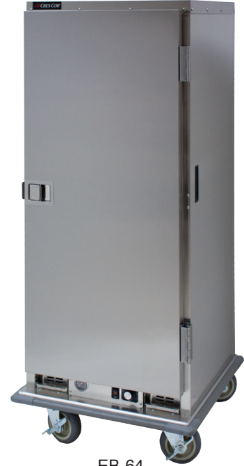
EB-64 (Shown with accessory options)