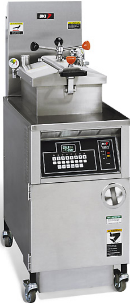
BKI's LGF-FC Gas Pressure Fryer shown above