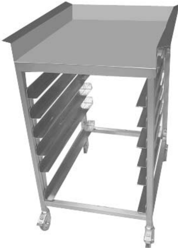
BKI's LTS shown above

Efficient and ergonomically designed mobile work station, optimal receiving platform to compliment your fried food system