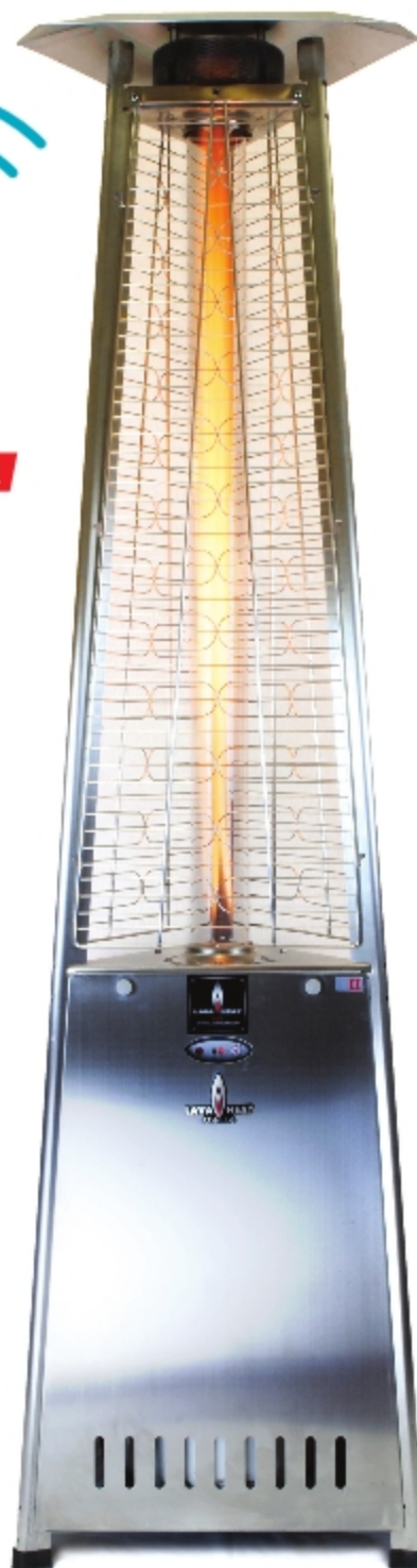
Shown: Stainless Steel

WWW.LAVAHEAT.COM INFO@LAVEHEAT.COM 1.888.779.LAVA