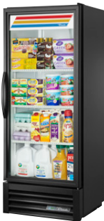
Standard Black Exterior