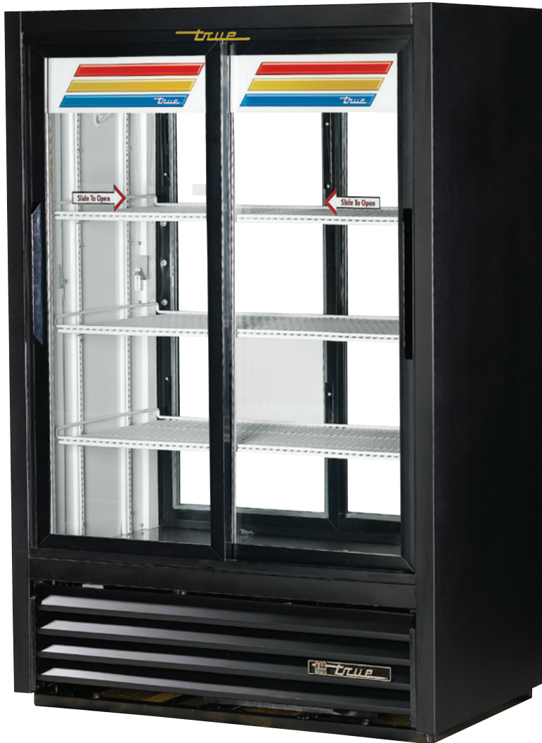
Shown with optional shelving.

Slide Door Lower Height Narrow Depth Fast Lane Pass-Thru Refrigerator