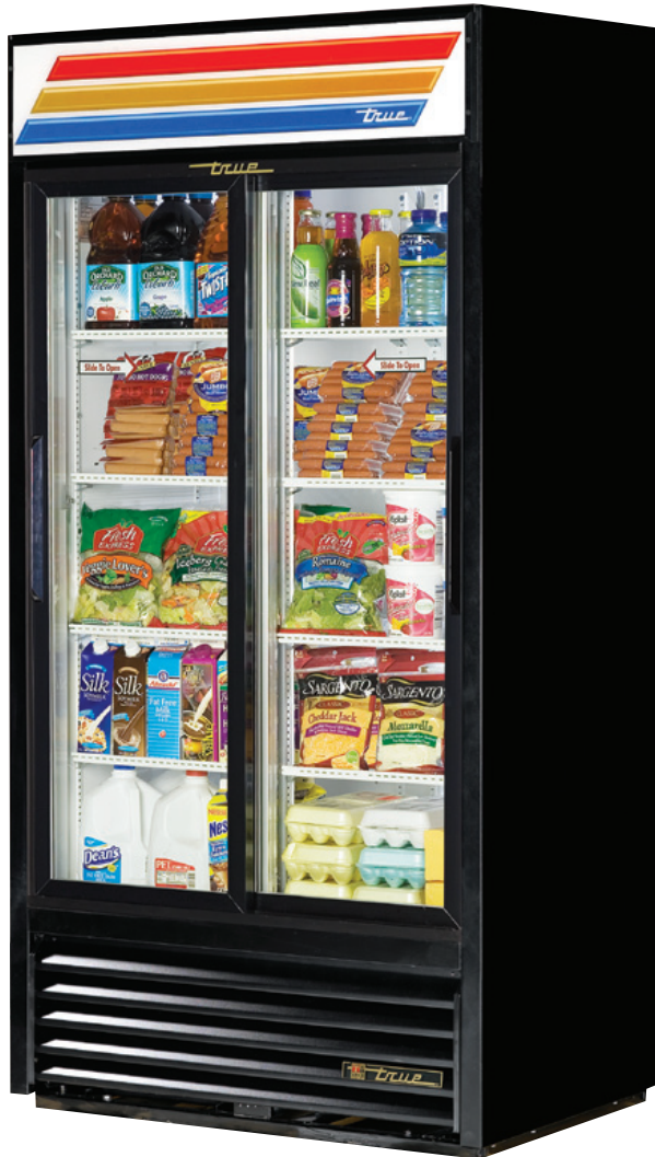
Shown with optional black exterior.