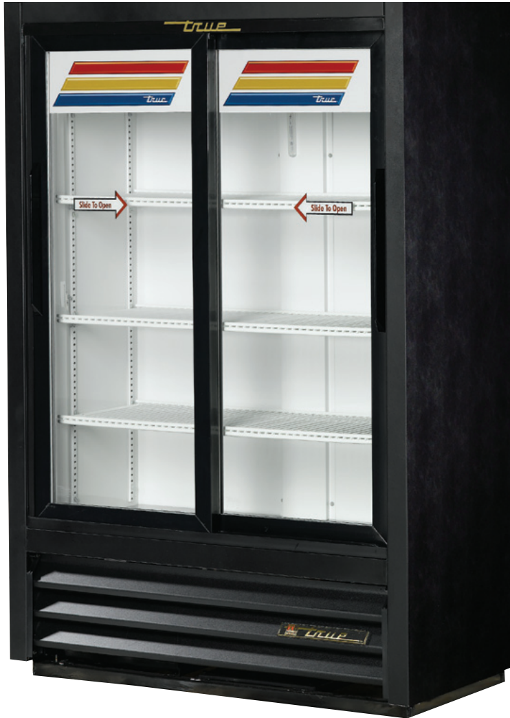
Shown with optional shelving.

Slide Door Lower Height Narrow Depth Refrigerator