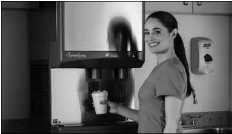
SensorSAFE not recommended for use with clear containers or for applications in direct sunlight

SensorSAFE™ infrared dispense (optional)