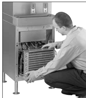
Icemaker in base slides out easily for service