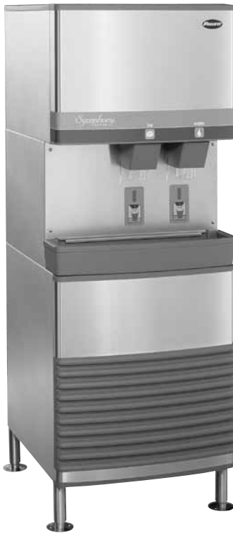
110FB400A-S (freestanding with SensorSAFE™ "-S" dispensing)