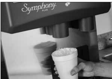
SensorSAFE not recommended for use with clear containers or for applications in direct sunlight