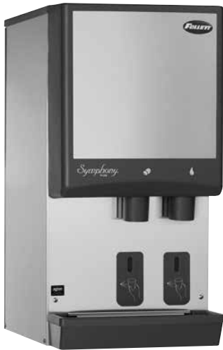
Shown with SensorSAFE™

12 CI series countertop with Chewblet® ice machine