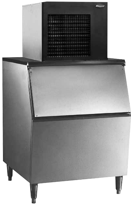
Model MFD400ABT flake icemaker (shown on Follett 425-30 ice storage bin, ordered separately)