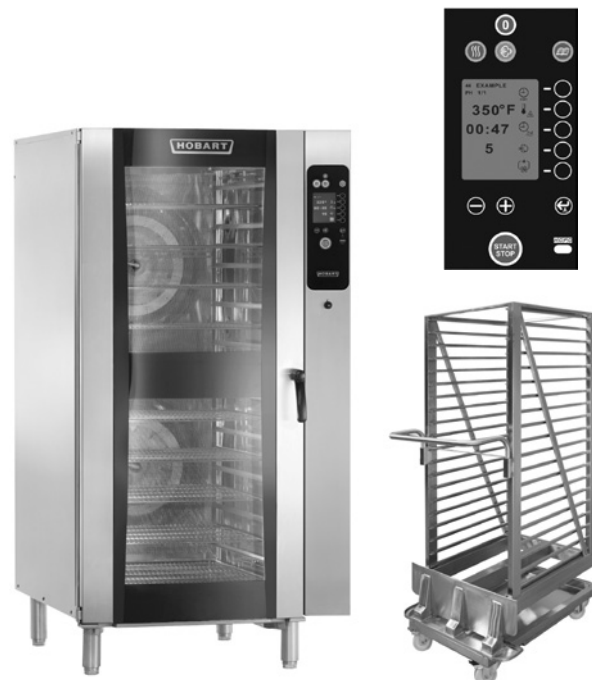
CE20FD shown with standard TTI-20F