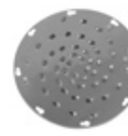
\frac{5}{16} " Shredder Plate