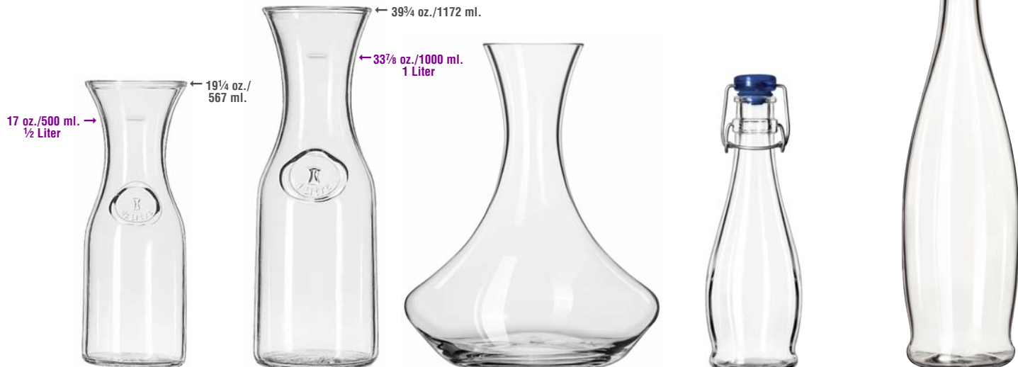
Wine Decanter No. 97001 19 1/4 oz./56.7 cl./567 ml. H8 5/8 T3 B3 1/2 D3 1/8 1 doz./13# = .72 cu.ft. SCC 604753 TRAEX TR-6BBB □ Wine Decanter No. 97000 39 3/4 oz./117.2 cl./1172 ml. H10 7/8 T3 1/2 B3 3/4 D3 3/4 1 doz./21# = 1.35 cu.ft. SCC 598069 TRAEX TR-11GGGGGA □ Vina Decanter No. 96958S1A ♂ 60 oz./1.7 L. H10 1/4 T3 1/8 B5 1/4 D7 3/8 2 pcs./7# = 1.01 cu.ft. SCC 293432 Water Bottle w/Wire Bail Lid No. 13151017 12 oz./35.5 cl./355 ml. H8 1/8 T1 1/4 B2 5/8 D2 1/2 1 doz./10# = .56 cu.ft. SCC 08002713088308 TRAEX TR-2HHHH □ Water Bottle w/Wire Bail Lid No. 13150020 33 3/8 oz./100.0 cl./1000 ml. H12 5/8 T1 1/8 B3 1/4 D3 1/2 1 doz./9# = .63 cu.ft. SCC 08002713013669 TRAEX TR-2GGGGGG □