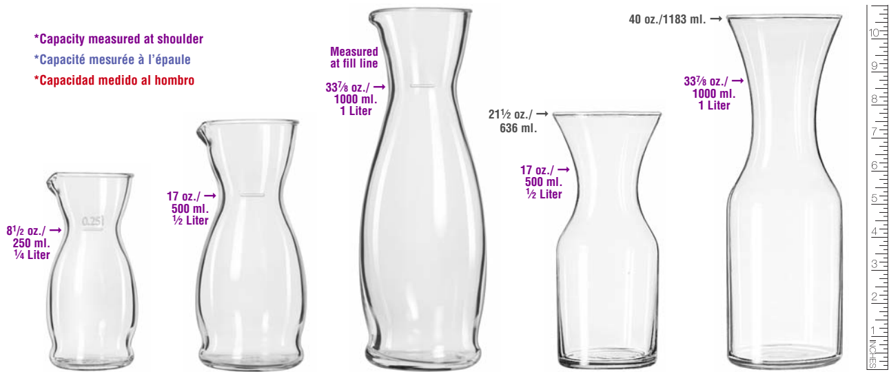
Carafe No. 13172621 H6 T2 3/4 B2 5/8 D2 7/8 1 doz./10# = .40 cu.ft. SCC 08002713097997 TRAEX TR-7CC □ Carafe No. 13172821 H7 5/8 T3 1/4 B3 1/4 D3 1/2 1 doz./14# = .76 cu.ft. SCC 08002713098000 TRAEX TR-6BBB □ Carafe No. 13173021 H11 T3 1/4 B3 1/2 D3 3/8 1 doz./22# = 1.34 cu.ft. SCC 08002713091056 TRAEX TR-8DDDDDD □ Decanter No. 789 21 1/2 oz./63.6 cl./636 ml. H7 3/4 T3 1/2 B3 D3 1/2 1 doz./10# = .79 cu.ft. SCC 491445 TRAEX TR-6BBB □ Decanter No. 795 40 oz./118.3 cl./1183 ml. H10 1/4 T3 3/4 B3 3/8 D3 3/4 1 doz./17# = 1.26 cu.ft. SCC 052066 TRAEX TR-11GGGGG □

*Capacity measured at shoulder *Capacité mesurée à l'épaule *Capacidad medido al hombro