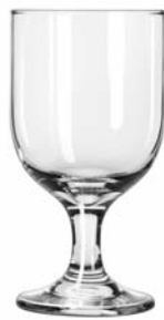
Goblet No. 3756 ■ 10¼ oz./30.3 cl./303 ml. H5¾ T3 B2¾ D3 2 doz./12# • .94 cu.ft. SCC 370075 TRAEX TR-12HH □