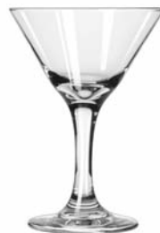
Cocktail No. 3771 ■ 5 oz./14.8 cl./148 ml. H5¼ T3¾ B2¾ D3¾ 3 doz./16# • 1.96 cu.ft. SCC 147991 TRAEX TR-11GG □