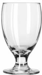
Banquet Goblet No. 3712 ■ No. 3752HT ★ ■ 10½ oz./31.1 cl./311 ml. H5¼ T2¾ B2¾ D3½ 2 doz./14# • .93 cu.ft. No. 3712-SCC 369994 No. 3752HT-SCC 370068 TRAEX TR-6BB □