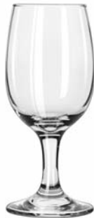
Wine No. 3765 ■ 8½ oz./25.1 cl./251 ml. H6¾ T2¾ B2¼ D2¾ 2 doz./11# • .87 cu.ft. SCC 370099 TRAEX TR-7CC □