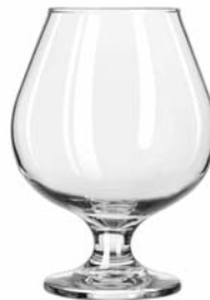
Brandy No. 3708 ■ 17 1/2 oz./51.8 cl./518 ml. H5 1/2 T2 3/8 B2 3/4 D4 2 doz./14# = 1.53 cu.ft. SCC 573929 TRAEX TR-8DD □