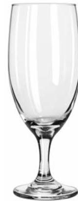
Tall Iced Tea No. 3750 ■ 16 oz./47.3 cl./473 ml. H8¾ T2¾ B3 D3 3 doz./24# • 2.18 cu.ft. SCC 858934 TRAEX TR-6BBB □