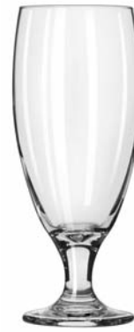
Pilsner No. 3804 ■ 16 oz./47.4 cl./473 ml. H7 3/8 T2 3/4 B2 3/4 D3 1/8 2 doz./15# = 1.28 cu.ft. SCC 391230 TRAEX TR-12HHH □