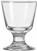
Footed Rocks No. 3746 ■ 5 1/2 oz./16.3 cl./163 ml. H4 1/8 T3 1/8 B2 3/4 D3 1/8 2 doz./13# = .69 cu.ft. SCC 370044 TRAEX TR-12H □