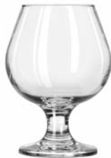
Brandy No. 3704 ■ 9 1/4 oz./27.4 cl./274 ml. H4 1/2 T2 1/4 B2 1/2 D3 3/8 2 doz./10# = .93 cu.ft. SCC 574810 TRAEX TR-6B □