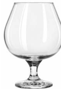
Brandy No. 3709 ■ 22 oz./65.1 cl./651 ml. H6 T2 3/4 B2 7/8 D4 3/8 1 doz./8# = .97 cu.ft. SCC 294602 TRAEX TR-8DD □