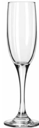
Tall Flute No. 3796 ■ 6 oz./17.7 cl./177 ml. H8¾ T2 B2¾ D2¾ 1 doz./6# • .59 cu.ft. SCC 574650 TRAEX TR-7CCCC □