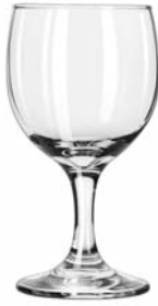
Wine No. 3764 ■ 8½ oz./25.1 cl./251 ml. H5½ T2½ B2¾ D3½ 2 doz./10# • .98 cu.ft. SCC 370082 TRAEX TR-12HH □