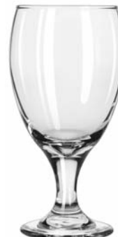
Embassy Royale Iced Tea No. 3716 ■ 16¼ oz./48.1 cl./481 ml. H7 T3¼ B3 D3½ 3 doz./28# • 2.31 cu.ft. SCC 516766 TRAEX TR-6BBB □