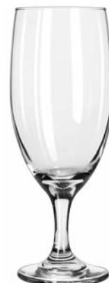
Embassy Royale Tall Iced Tea No. 3750 ■ 16 oz./47.3 cl./473 ml. H8¾ T2¾ B3 D3 3 doz./24# • 2.18 cu.ft. SCC 858934 TRAEX TR-6BBB □