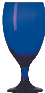
Première Tall Iced Tea No. 4116SRB/UPC00 ✕■ 16¼ oz./48.1 cl./481 ml. H7 T3¼ B3 D3½ 1 doz./9# • .78 cu.ft. SCC 555588 TRAEX TR-6BBB □