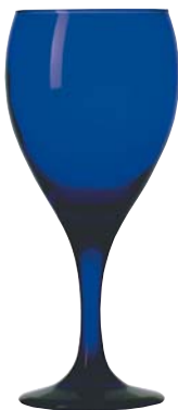
Teardrop Goblet No. 3911B ■ 12 oz./35.5 cl./355 ml. H7¼ T2¾ B2¾ D3¾ 1 doz./8# • .71 cu.ft. SCC 451651 TRAEX TR-6BBB □