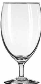
Citation Iced Tea No. 8439 ● 16½ oz./48.8 cl./488 ml. H7 T3¾ B2¾ D3½ 1 doz./8# • .74 cu.ft. SCC 018410 TRAEX TR-6BBB □