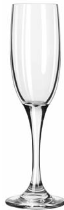
Tall Flute No. 4196SR ✕■ 6 oz./17.7 cl./177 ml. H8¾ T2 B2¾ D2¾ 2 doz./12# • 1.16 cu.ft. SCC 878390 TRAEX TR-7CCCC □