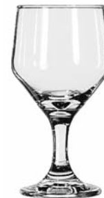
Wine No. 3364 ■ 8½ oz./25.1 cl./251 ml. H5¾ T2½ B2¾ D3½ 3 doz./20# • 1.57 cu.ft. SCC 056552 TRAEX TR-12HH □