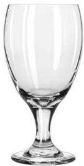
Tall Iced Tea No. 4116SR ✕■ 16¼ oz./48.1 cl./481 ml. H7 T3¼ B3 D3½ 2 doz./18# • 1.55 cu.ft. SCC 451333 TRAEX TR-6BBB □