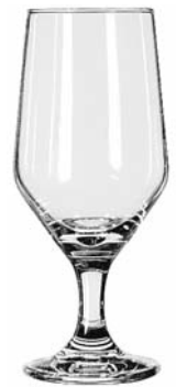
Beer No. 3328 ■ 12 oz./35.5 cl./355 ml. H7½ T2½ B2¾ D3½ 3 doz./23# • 1.79 cu.ft. SCC 056682 TRAEX TR-12HHH □