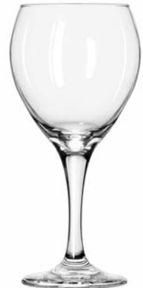
Balloon No. 3061 ■ 20 oz./59.2 cl./592 ml. H8½ T3¼ B3¼ D4¼ 1 doz./9# = 1.22 cu.ft. SCC 077578 TRAEX TR-8DDDD □