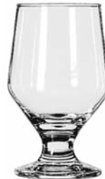
Footed All Purpose Goblet No. 3312 ■ 10½ oz./31.1 cl./311 ml. H5¼ T2½ B2¾ D3½ 3 doz./21# • 1.43 cu.ft. SCC 054893 TRAEX TR-12HH □