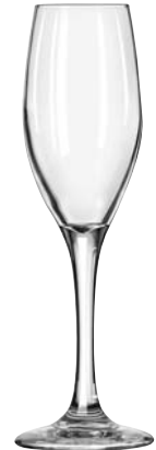
Flute No. 3096 ■ 5¾ oz./17.0 cl./170 ml. H8½ T1½ B2¾ D2¾ 1 doz./6# = .57 cu.ft. SCC 252340 TRAEX TR-7CCC □