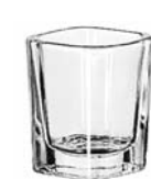
Prism Shot No. 5277 2 oz./5.9 cl./59 ml. H2½ T1½ B1½ D1½ 6 doz./26# • .58 cu.ft. SCC 048618 TRAEX TR-9 □