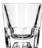
Old Fashioned No. 5131 4 oz./11.8 cl./118 ml. H3½ T2¾ B2¼ D2¾ 4 doz./33# • .99 cu.ft. SCC 370129 TRAEX TR-7 □