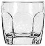
Rocks No. 2484 ● 8 oz./23.7 cl./237 ml. H3½ T3½ B2½ D3½ 3 doz./19# • .93 cu.ft. SCC 744671 TRAEX TR-12A □