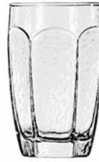
Beverage No. 2489 ● 10 oz./29.6 cl./296 ml. H4¾ T2¾ B2½ D3 3 doz./20# • 1.13 cu.ft. SCC 744688 TRAEX TR-12HA □