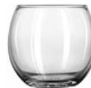
Votive No. 1965 4¾ oz./14.1 cl./141 ml. H2½ T2½ B1¾ D2¾ 3 doz./7# • .47 cu.ft. SCC 843210 TRAEX TR-13MA □