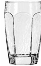
Beverage No. 2488 ● 12 oz./35.5 cl./355 ml. H5¼ T2¾ B2¼ D3½ 3 doz./26# • 1.33 cu.ft. SCC 753857 TRAEX TR-12HH □