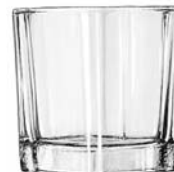
Rocks No. 5279 9 oz./26.6 cl./266 ml. H3½ T3 B2¾ D3 3 doz./34# • .91 cu.ft. SCC 766468 TRAEX TR-6B □