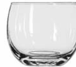
Rocks No. 1968CD ▲ 8¼ oz./24.4 cl./244 ml. H2¾ T2¾ B1½ D3¼ 4 doz./17# • 1.11 cu.ft. SCC 783793 TRAEX TR-6 □

See page 38 for the complete Chivalry line.