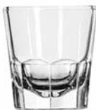
Old Fashioned No. 5130 5 oz./14.8 cl./148 ml. H3½ T2¾ B2¼ D2¾ 3 doz./19# • .74 cu.ft. SCC 073221 TRAEX TR-7 □