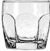
Rocks No. 2485 ● 10 oz./29.6 cl./296 ml. H3¾ T3¼ B2½ D3¾ 3 doz./24# • 1.12 cu.ft. SCC 753819 TRAEX TR-6A □