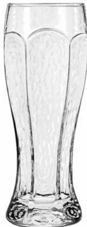
Giant Beer No. 2478 ● 22¾ oz./67.3 cl./673 ml. H9½ T3¼ B3½ D3¾ 1 doz./16# • .96 cu.ft. SCC 575978 TRAEX TR-6BBBB □