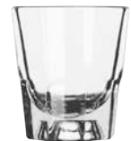
Old Fashioned No. 5131 4 oz./11.8 cl./118 ml. H 3\frac{1}{8} T 2\frac{3}{8} B 2\frac{1}{4} D 2\frac{3}{8} 4 doz./33# • .99 cu. ft. SCC 370129