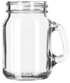
Drinking Jar No. 97124 4.75 oz./14.0 cl./140 ml. H 3\frac{3}{8} T 1\frac{1}{8} B 2\frac{1}{8} D 2\frac{1}{8} 1 doz./5# • .21 cu.ft. SCC 495259