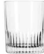
Rocks No. 15626 + 8 \frac{1}{2} oz./25.1 cl./251 ml. H 3\frac{3}{8} T3 B 2\frac{5}{8} D3 3 doz./23# • .87 cu. ft. SCC 005168