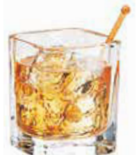
Rocks No. 5279 9 oz./26.6 cl./266 ml. H 3\frac{1}{2} T3 B 2\frac{3}{4} D3 3 doz./34# • .91 cu. ft. SCC 766468