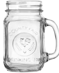
Drinking Jar No. 97085 16 \frac{1}{2} oz./48.8 cl./488 ml. H 5\frac{1}{4} T 2\frac{3}{8} B 2\frac{1}{2} D 4\frac{1}{8} 1 doz./12# • .62 cu. ft. SCC 866288