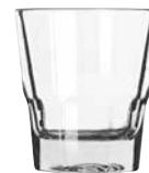
Old Fashioned No. 5130 5 oz./14.8 cl./148 ml. H 3\frac{1}{8} T 2\frac{3}{8} B 2\frac{1}{4} D 2\frac{3}{8} 3 doz./19# • .74 cu. ft. SCC 073221