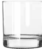
Rocks No. 9171CD ▲ ● 11 oz./32.5 cl./325 ml. H 3\frac{1}{2} T 3\frac{1}{4} B 3\frac{1}{8} D 3\frac{1}{4} 3 doz./26# • 1.05 cu. ft. SCC 087051