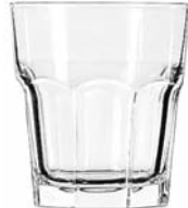
Double Rocks No. 15243 + 12 oz./35.5 cl./355 ml. H4 T3½ B2¾ D3¾ 3 doz./27# • 1.30 cu.ft. SCC 733200 TRAEX TR-11G □