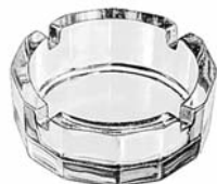
Gibraltar Ashtray No. 5172 4" 3 doz./24# • .71 cu.ft. SCC 023455 TRAEX TR-3 □