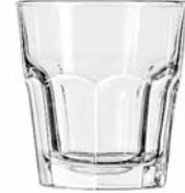
Rocks No. 15242 + 9 oz./26.6 cl./266 ml. H3½ T3½ B2½ D3½ 3 doz./22# • 1.07 cu.ft. SCC 733187 TRAEX TR-6A □