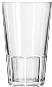
Mixing Glass No. 15230 + 16 oz./47.3 cl./473 ml. H5½ T3½ B2½ D3½ 2 doz./26# • 1.27 cu.ft. SCC 025791 TRAEX TR-6BB □