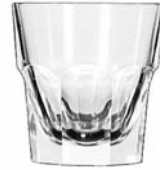
Tall Rocks No. 15245 + 7 oz./20.7 cl./207 ml. H3½ T3¼ B2½ D3¼ 3 doz./26# • .97 cu.ft. SCC 109012 TRAEX TR-6A □