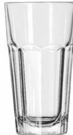
Beverage No. 15383 + 10½ oz./31.1 cl./311 ml. H5½ T3 D3 1 doz./10# • .43 cu.ft. SCC 6943949907051 TRAEX TR-12HH □