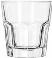
Rocks No. 15232 + 10 oz./29.6 cl./296 ml. H3½ T3½ B2½ D3½ 3 doz./27# • 1.19 cu.ft. SCC 105373 TRAEX TR-6B □