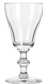
Georgian Irish Coffee No. 8054 6 oz./17.7 cl./177 ml. H5¾ T2½ B2¾ D2½ 3 doz./15# • 1.25 cu. ft. SCC 435095