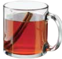
Mug No. 5213 13 oz./38.5 cl./385 ml. H3¾ T3¾ B3¾ D4¾ 1 doz./13# • .52 cu. ft. SCC 886531