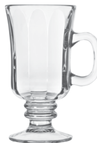
Irish Coffee with optic No. 5294 8¼ oz./24.4 cl./244 ml. H5½ T3½ B2¾ D4½ 2 doz./22# • 1.13 cu. ft. SCC 057986