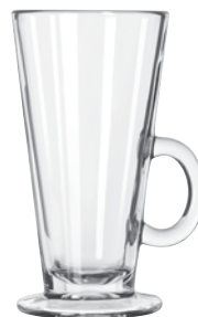
Irish Coffee No. 5293 8½ oz./25.1 cl./251 ml. H5½ T3 B2¾ D3¾ 2 doz./21# • 1.04 cu. ft. SCC 878154