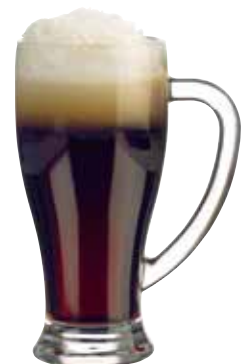
Cafe Mug No. 5286 14 oz./41.4 cl./414 ml. H6¾ T3½ B2½ D5 1 doz./17# • .86 cu. ft. SCC 592061