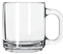
Mug No. 5201 10 oz./29.6 cl./296 ml. H3½ T3¼ B2¼ D4½ 1 doz./10# • .44 cu. ft. SCC 708673