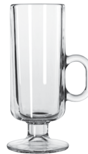
Irish Coffee No. 5292 8 oz./23.7 cl./237 ml. H6½ T2¾ B2¾ D3¾ 2 doz./25# • 1.06 cu. ft. SCC 878161