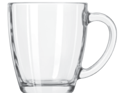
Square Mug No. 5352 14 oz./41.4 cl./414 ml. H4 T3½ B2½ D4¾ 1 doz./10# • .68 cu. ft. SCC 394583