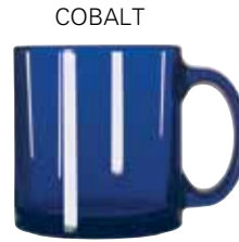
Mug No. 5213B 13 oz./38.5 cl./385 ml. H3¾ T3¾ B3¾ D4¾ 1 doz./13# • .52 cu. ft. SCC 310869