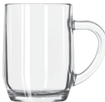
All Purpose Mug No. 5724 10 oz./29.6 cl./296 ml. H4½ T2½ B2¾ D4¾ 3 doz./30# • 1.37 cu. ft. SCC 373540