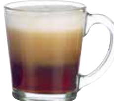
All Purpose Mug No. 5544 13½ oz./39.9 cl./399 ml. H4½ T3¾ B2¾ D5 1 doz./11# • .64 cu. ft. SCC 269673