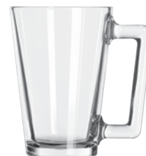
All Purpose Mug No. 5589 9 oz./26.6 cl./266 ml. H4½ T3½ B2½ D4¼ 2 doz./21# • 1.01 cu. ft. SCC 308160

Thermal shock, taking a cold glass and pouring a hot beverage into it, can damage glassware. It is recommended to pre-heat the glassware before adding a steaming hot beverage.