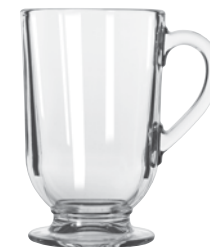
Irish Coffee No. 5304 10½ oz./31.1 cl./311 ml. H5 T3½ B2¾ D4¼ 1 doz./12# • .49 cu. ft. SCC 840298