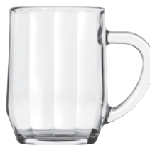
All Purpose Optic Mug No. 5725 10 oz./29.6 cl./296 ml. H4½ T2½ B2¾ D4¾ 3 doz./30# • 1.37 cu. ft. SCC 373557