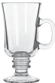
Irish Coffee No. 5295 8½ oz./25.1 cl./251 ml. H5½ T3½ B2¾ D4½ 2 doz./21# • 1.13 cu. ft. SCC 030101