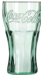
Coca-Cola Genuine Tumbler No. 2216CC 16¾ oz./49.5 cl./495 ml. H6½ T3¼ B2½ D3¾ 1 doz./9# • 63 cu.ft. SCC 280081 TRAEX TR-11GG □