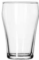
Bell Fountain Tumbler No. 30 ● 6¾ oz./20.0 cl./200 ml. H4 T2½ B1¾ D2½ 6 doz./24# • 1.24 cu.ft. SCC 508297 TRAEX TR-13MMM □