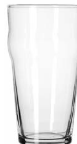
English Pub Glass No. 14806HT ●★ 16 oz./47.3 cl./473 ml. H6 T3½ B2¼ D3¼ 3 doz./24# • 1.60 cu.ft. SCC 005144 TRAEX TR-6BB □