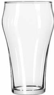
Bell Soda No. 539HT ●★ 21 oz./62.1 cl./621 ml. H6½ T3¾ B2¾ D3¾ 3 doz./31# • 2.29 cu.ft. SCC 564934 TRAEX TR-11GGA □

Use one of Libbey's Coca-Cola® glasses and get a smile from your customers.