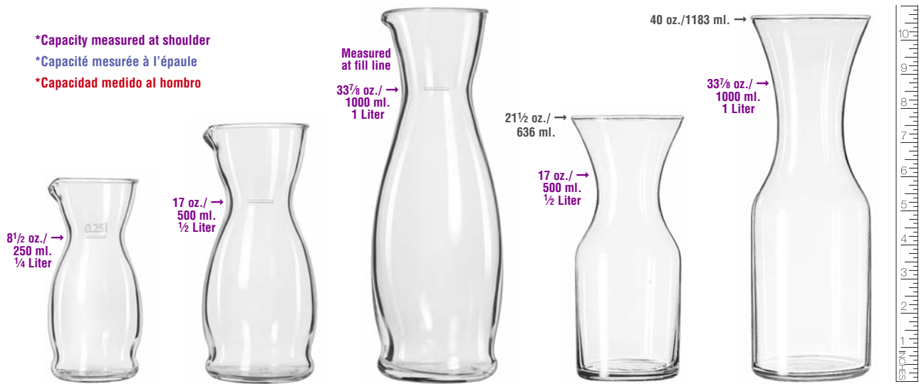
Carafe No. 13172621 H6 T2 3/4 B2 5/8 D2 7/8 1 doz./10# = .40 cu.ft. SCC 08002713097997 TRAEX TR-7CC □

*Capacity measured at shoulder *Capacité mesurée à l'épaule *Capacidad medido al hombro