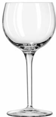
All Purpose Wine No. C152ZX ◆ 17½ oz./52.0 cl./520 ml. H8¼ T3½ B3¾ D4 2 doz./17# = 2.51 cu.ft. SCC 08004743003214 TRAEX TR-8DDDD □