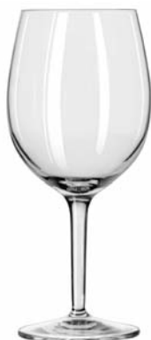
Bordeaux No. C243ZX ◆ 16¼ oz./48.0 cl./480 ml. H7½ T2¾ B3 D3½ 2 doz./13# = 1.73 cu.ft. SCC 08004743012827 TRAEX TR-6BBB □