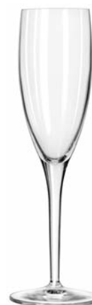
Flute No. C145ZX ◆ 6¾ oz./20.0 cl./200 ml. H9½ T2½ B2¾ D2¾ 2 doz./11# = 1.41 cu.ft. SCC 08004743000039 TRAEX TR-7CCCC □