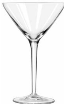
Martini No. C166ZX ◆ 9½ oz./28.0 cl./280 ml. H7½ T4½ B3 D4½ 16 pc./9# = 1.84 cu.ft. SCC 08004743003948 TRAEX TR-18JJJ □