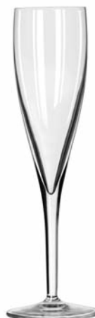
Champagne No. C228ZX ◆ 6¼ oz./18.5 cl./185 ml. H9¼ T2½ B2¾ D2¾ 2 doz./14# = 1.39 cu.ft. SCC 08004743012261 TRAEX TR-7CCCC □