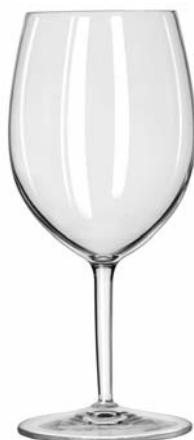
Bordeaux Grand Cru No. C234ZX ◆ 25¾ oz./76.0 cl./760 ml. H9 T3¼ B3½ D4 1 doz./11# = 1.54 cu.ft. SCC 08004743012353 TRAEX TR-8DDDD □