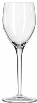
Wine No. C143ZX ◆ 9¼ oz./27.5 cl./275 ml. H8½ T2¾ B3 D3 2 doz./11# = 1.48 cu.ft. SCC 08004743000015 TRAEX TR-6BBBB □