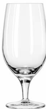
All Purpose Goblet No. C82ZX ◆ 19½ oz./57.5 cl./575 ml. H7¾ T2¾ B3 D3½ 2 doz./20# = 1.73 cu.ft. SCC 08004743001203 TRAEX TR-6BBB □