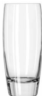
Beverage No. PM514ZX ◆ 14¾ oz./43.5 cl./435 ml. H6½ T2¾ B2 D2¾ 2 doz./20# • 1.02 cu.ft. SCC 08004743006284 TRAEX TR-7CCA □