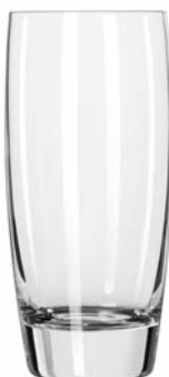
Beverage No. PM784ZX ◆ 20 oz./59.1 cl./591 ml. H7½ T2¾ B2¼ D3 2 doz./30# • 1.49 cu.ft. SCC 08004743020747 TRAEX TR-12HHH □