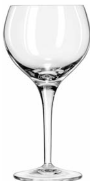
All Purpose Burgunder No. C189ZX ◆ 13½ oz./40.0 cl./400 ml. H7½ T3¼ B3 D3¼ 16 pc./11# = 1.34 cu.ft. SCC 08004743005980 TRAEX TR-11GGG □