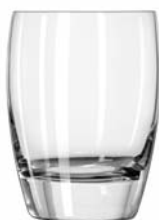
Double Old Fashioned No. PM515ZX ◆ 11¼ oz./34.5 cl./345 ml. H4¼ T3 B2¼ D3½ 2 doz./17# • .88 cu.ft. SCC 08004743006307 TRAEX TR-12H □