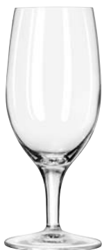
All Purpose No. C52ZX ◆ 12½ oz./37.0 cl./370 ml. H7¼ T2¾ B3 D3 2 doz./12# = 1.20 cu.ft. SCC 08004743025711 TRAEX TR-6BBB □

Michelangelo provides an excellent selection of shapes and capacities to compliment your wine and beverage service.