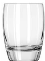
Rocks/Juice No. PM521ZX ◆ 9 oz./26.5 cl./265 ml. H4 T2¾ B2½ D2½ 2 doz./15# • .67 cu.ft. SCC 08004743006956 TRAEX TR-7C □