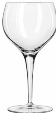
Burgunder No. C343ZX ◆ 17 oz./50.0 cl./500 ml. H7¾ T3¾ B3¼ D4 2 doz./16# = 2.58 cu.ft. SCC 08004743020723 TRAEX TR-8DDDD □

Michelangelo provides an excellent selection of shapes and capacities to compliment your wine and beverage service.