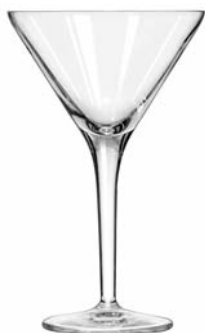
Martini No. C211ZX ◆ 7¼ oz./21.5 cl./215 ml. H6¾ T4½ B2¾ D4½ 2 doz./11# • 2.08 cu.ft. SCC 08004743009445 TRAEX TR-8DDD □