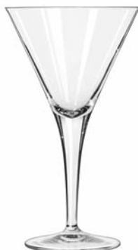
Martini No. C285ZX ◆ 8¾ oz./26.0 cl./260 ml. H7½ T4 B3 D4 2 doz./11# • 2.30 cu.ft. SCC 08004743016078 TRAEX TR-8DDD □