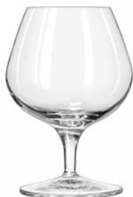
Napoleon Brandy No. C49ZX ◆ 13¼ oz./39.5 cl./395 ml. H5½ T2½ B3 D3¾ 16 pc./7# • .96 cu.ft. SCC 08004743000855 TRAEX TR-11GG □