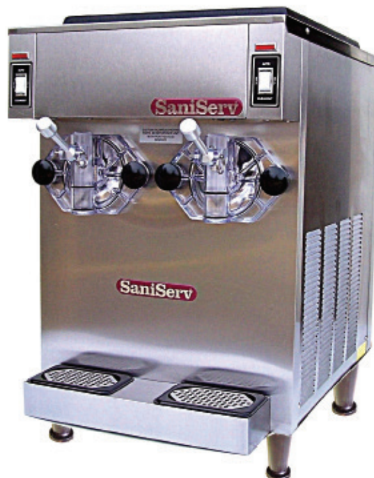
Model 691 Twin Flavor Counter Model Shake Machine With AccuFreeze™ Control

Durability – SaniServ ® machines are built to achieve long and dependable life through simplicity of design. Every machine is shipped standard with a stainless steel exterior, durable steel interior frame construction, heavy-duty components and consistency systems.