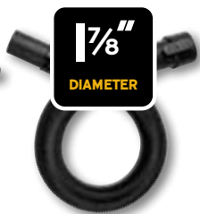
7/8" DIAMETER Expandable Locking Hose Expands from 2'-7' WS17821A