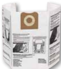
WS32200F Fits 12-16 Gallon Vacs