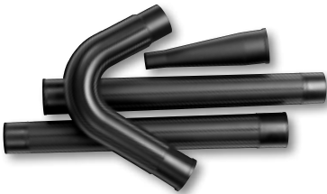
Gutter Cleaning Kit WS25051A