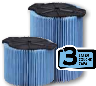
WS12045F WS22200F FINE DUST FILTERS 1 Micron @ 99% Efficiency

All other filters fit 5 to 16 gallon vacs, except WS0500VA.