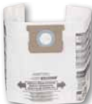
WS32090F Fits 6-9 Gallon Vacs plus WS0500VA