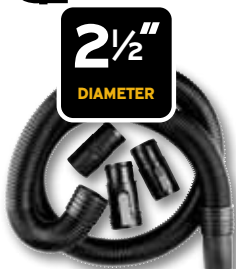
2 1/2" DIAMETER 7' Dual-Flex™ Locking Hose WS25020A