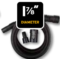
7/8" DIAMETER 7' Locking Hose Locking tab quickly secures WS17820A