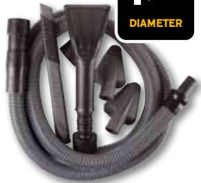
Premium Auto Cleaning Kit WS12552A