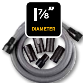
10' Contractor Grade Locking Hose WS17823A