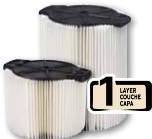
WS11045F WS21200F STANDARD FILTERS 5 Microns @ 95% Efficiency

WORKSHOP cartridge filters not only protect the vac's internal components from damaging debris, but also prevent harmful contaminants from re-entering the atmosphere. There's a filter to stop all sorts of debris, from everyday dirt to drywall dust to pollens and allergens. There's even a WET ONLY filter for the most demanding, high volume water-borne debris situations.