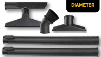
6 Piece Kit WS17856A 2 Extension Wands, Utility Nozzle, Dusting Brush, Wet Nozzle, Crevice Tool