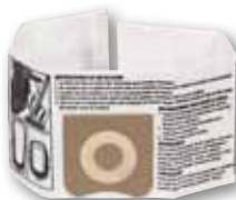
WS32045F Fits 3-4.5 Gallon Vacs

Dust bags make collection and disposal of dry debris cleaner, easier and more convenient.