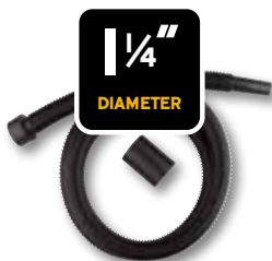
1/4" DIAMETER 6' Hose WS12520A

The Contractor grade hose is more flexible and durable than a standard hose.