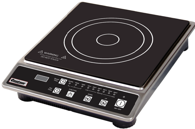
AIN1800E 1800W Induction Range For Moderate Use