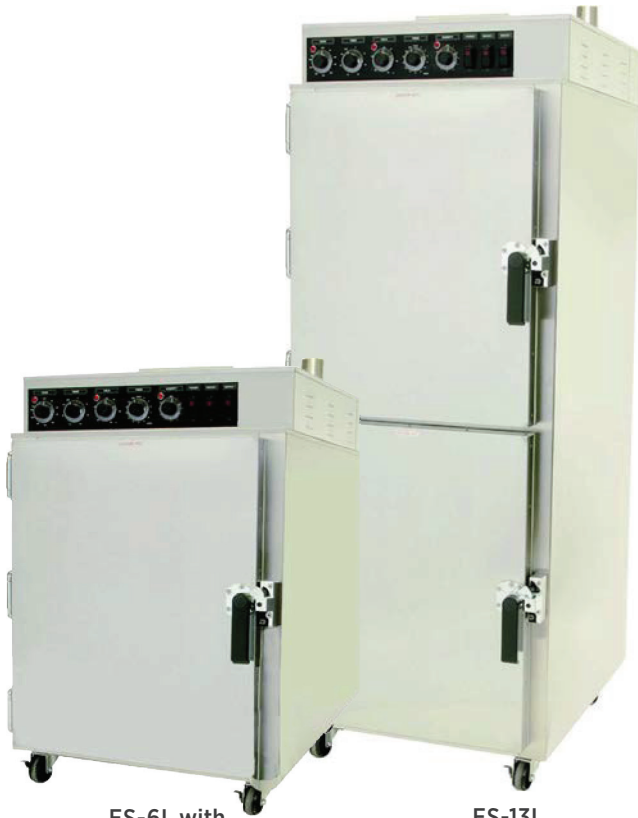
ES-6L with optional casters